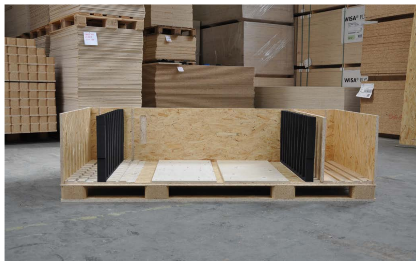
Clip-Lok Expendable box built up with ETHA foam ready to protect the aluminium profiles.