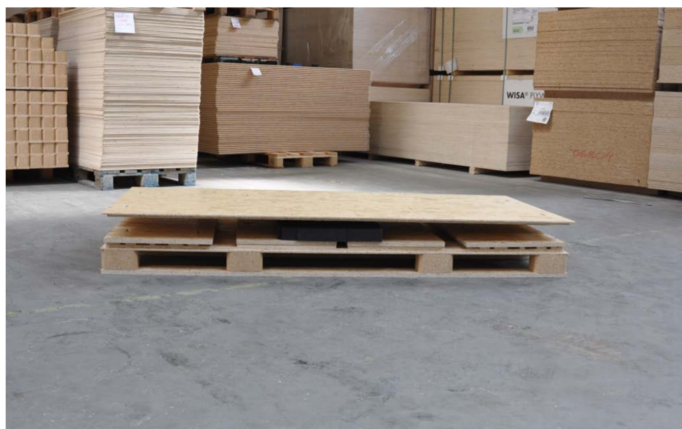
Clip-Lok Expendable box flat-packed with dunnages integrated within the packaging.