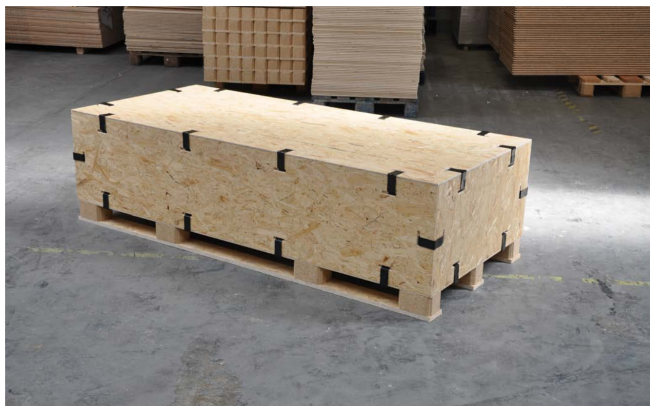
Clip-Lok Expendable box loaded with aluminium profiles ready for transport.